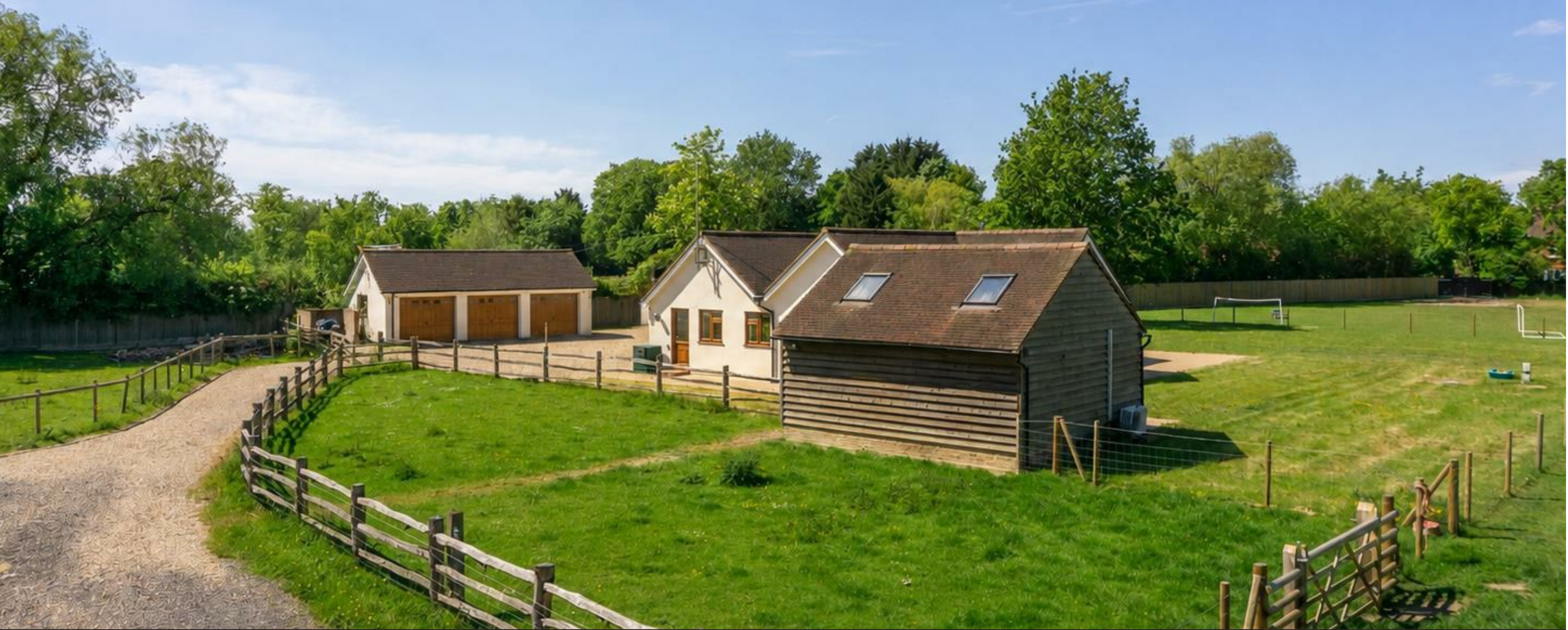
Woodside The Close, Horley, Surrey, RH6 9EB £4,000 Per Month